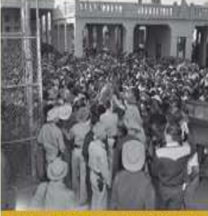
Mexicali, 1964. Mexican workers awa legal employment in the United States