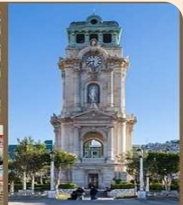
Tour por la ciudad