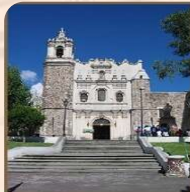
Pachuca de Soto