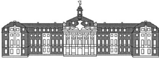
WESTFÄLISCHE WILHELMS-UNIVERSITÄT MÜNSTER